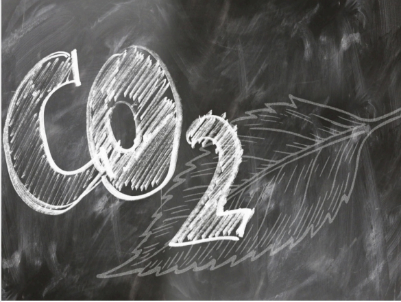
CO 2 in the classroom

In most lessons, and I'm sure you know this, someone calls "Open the window. I get very sleepy!" or a new teacher comes into the room and before the "good morning" comes a "Open all the windows immediately!".