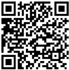
measureAPP für Android Betriebssysteme

The Cobra SMARTsense and measureAPP are required for the measurement of the carbon dioxide content. The app can be downloaded for free from the App Store - QR codes see below. Check whether Bluetooth is activated on your device (tablet, smartphone).