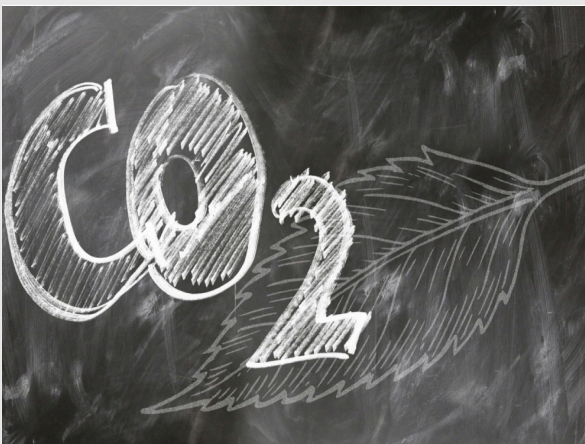
CO 2 in the classroom

Carbon dioxide (CO 2 ) gives discussion material for several lessons in the present time. The main focus is on the topic covered by CO 2 accelerated climate change and the reduction of the CO 2 emissions.