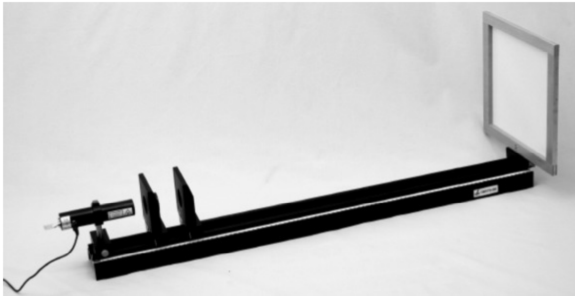
Figure 1: Experimental Set-up