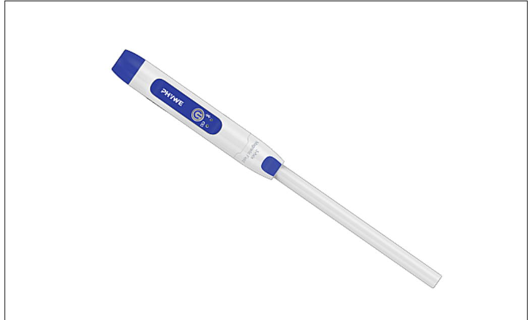
Fig. 1: 12947-00 Cobra SMARTsense 3-Axis Magnetic Field

The unit complies with the applicable EC-guidelines