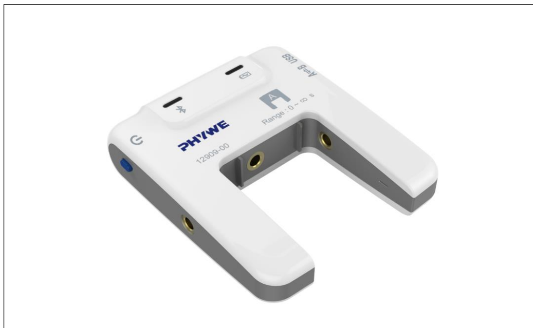
Fig. 1: 12909-00 Cobra SMARTsense Photogate