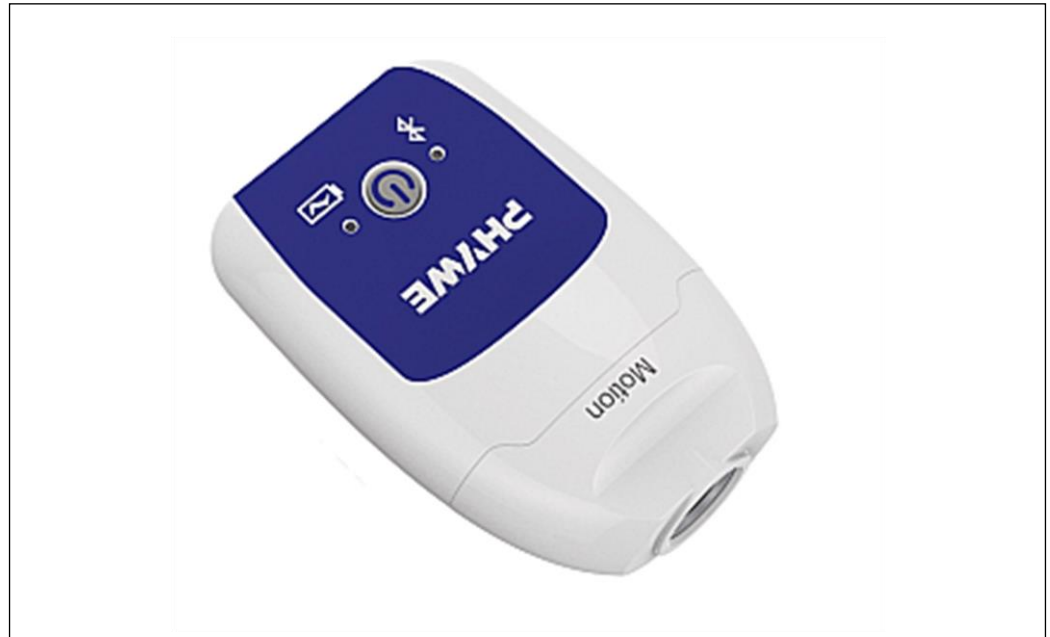
Fig. 1: 12908-01 Cobra SMARTsense Motion